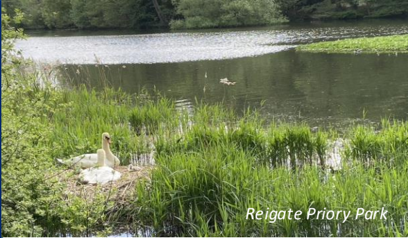
Reigate Priory Park