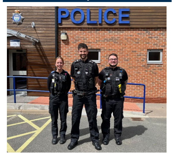
Welcome to your monthly newsletter! Focusing on the priorities that you want your local policing team to deal with