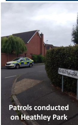
Patrols conducted on Heathley Park