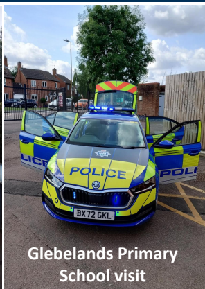
Glebelands Primary School visit