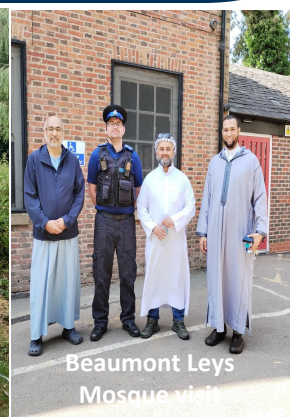
Beaumont Leys Mosque visit