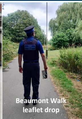
Beaumont Walk leaflet drop