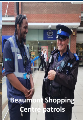
Beaumont Shopping Centre patrols