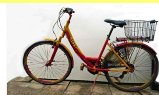
"Betty the Bike"

Part of an initiative supported by the University of Oxford's Science Together project