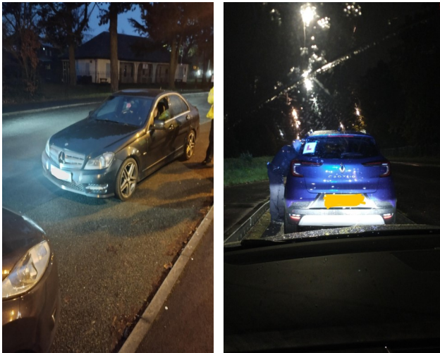
Vehicles stopped and dealt with for numerous offences .