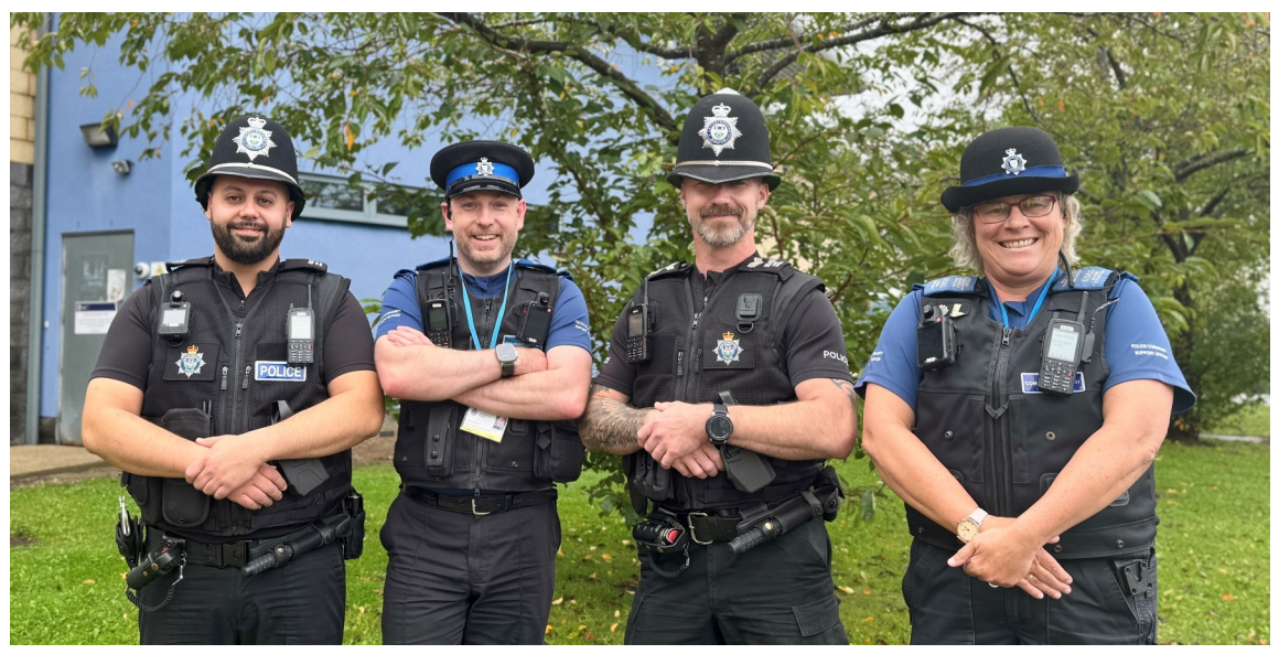
PC 4042 Baladi