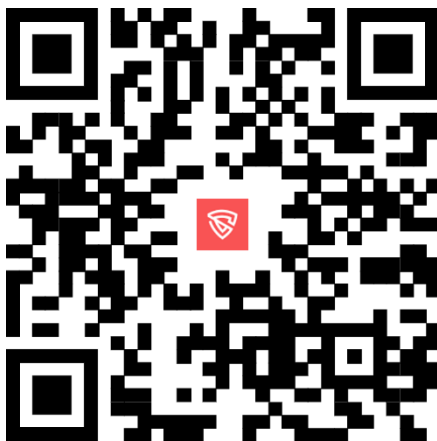
Little Book of Big Scams