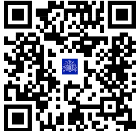
Little Book of Cyber Scams