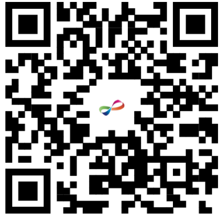
Age UK Scam Support