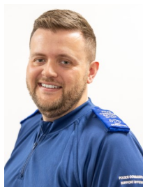
PCSO 6170 Donington