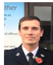
PS 671 Skelsey