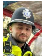
PC 2300 Thompson