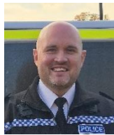
PC 1372 Breeze

North Warwickshire South Safer Neighbourhood Team Covering: Coleshill Town, Fillongley, Corley, Packington, Maxstoke, Shustoke, Arley, Old Arley, Ansley Common, Ansley village, Birchley Heath, Astley, Furnace End and Over Whitacre