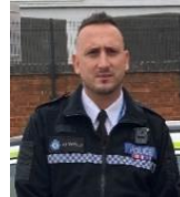
PC 2190 Howells