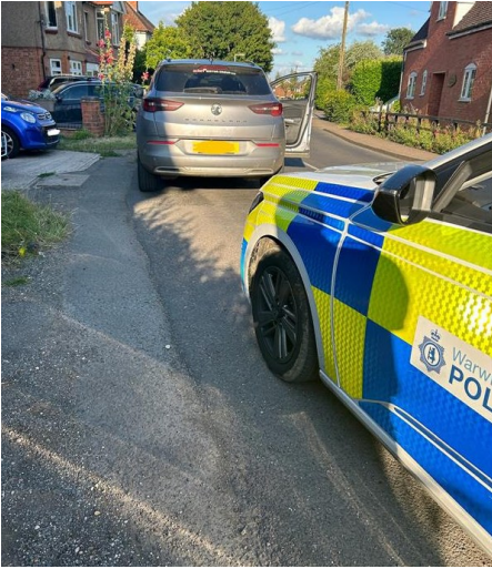
PC Reading and PCSO Allen stopped a vehicle in Kineton

following some proactive, intelligence-led patrols of the area.