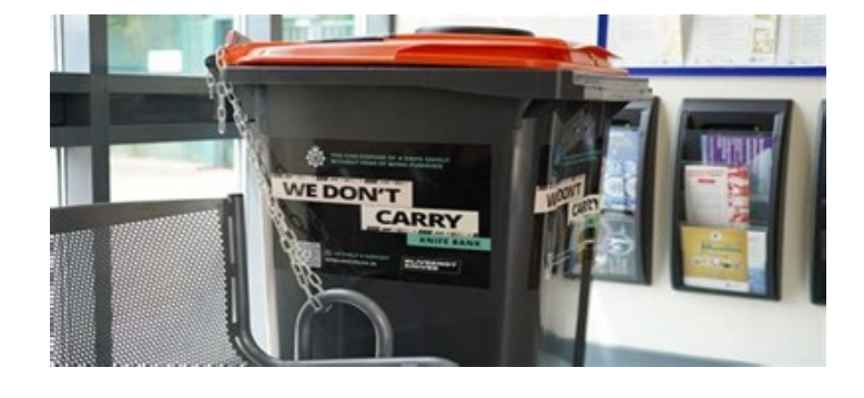
Register at www.neighbourhoodlink.co.uk

\cdot From 24 September 2024 having a zombie-style knife or machete will be against the law. If you're found with one, you could be prosecuted.