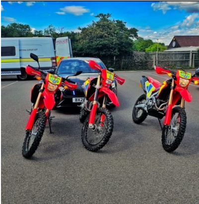
Police motor bikes.