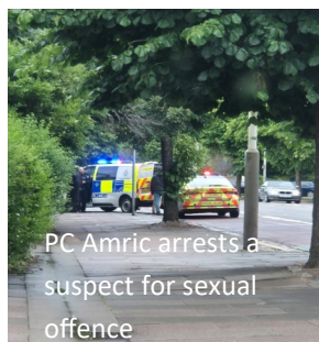
PC Amric arrests a suspect for sexual offence