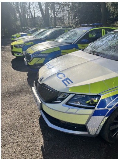
Police traffic vehicles