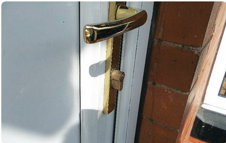
◀ Incorrectly measured lock protruding from the door handle

Contact your local Crime Reduction Officer for further advice Simply call 101 or visit www.westyorkshire.police.uk