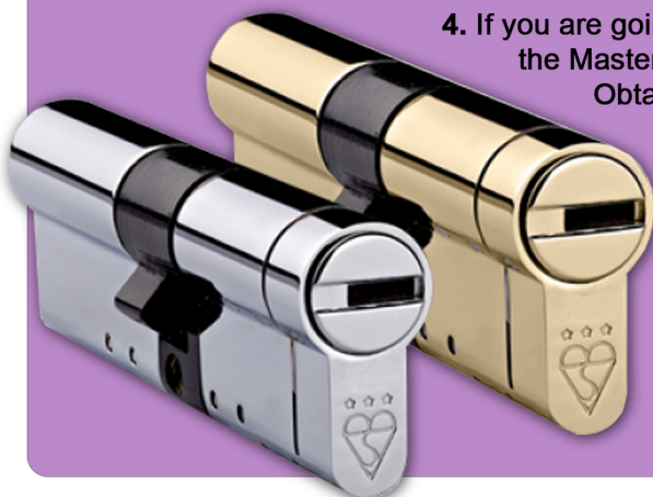
◀ Example of a TS007 3 Star Europrofile lock