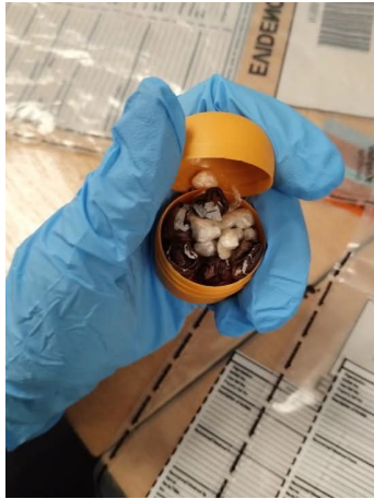
Drugs that were found in possession of a prolific offender.