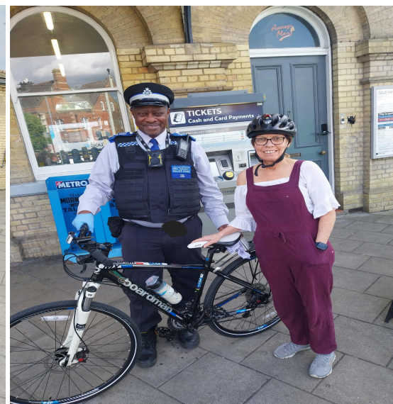
Above left & right Bike Marking Events in front of Norbiton Train Station Below Chair Exercises at the Queen Mary Hall Cambridge Gardens on 10th June 2026 followed by presentations about community safety and other local services