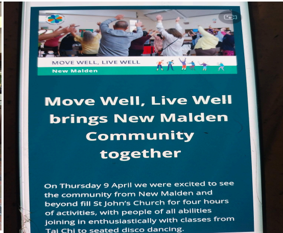
Above left Crime Prevention Stall on 23 May 2026 & right Move Well, Live Well Event on 9th April 2026. Both engagement events were held at St John's New Malden Church KT3 3RX. The move Well Event was well attended and involved Tai Chi Exercises