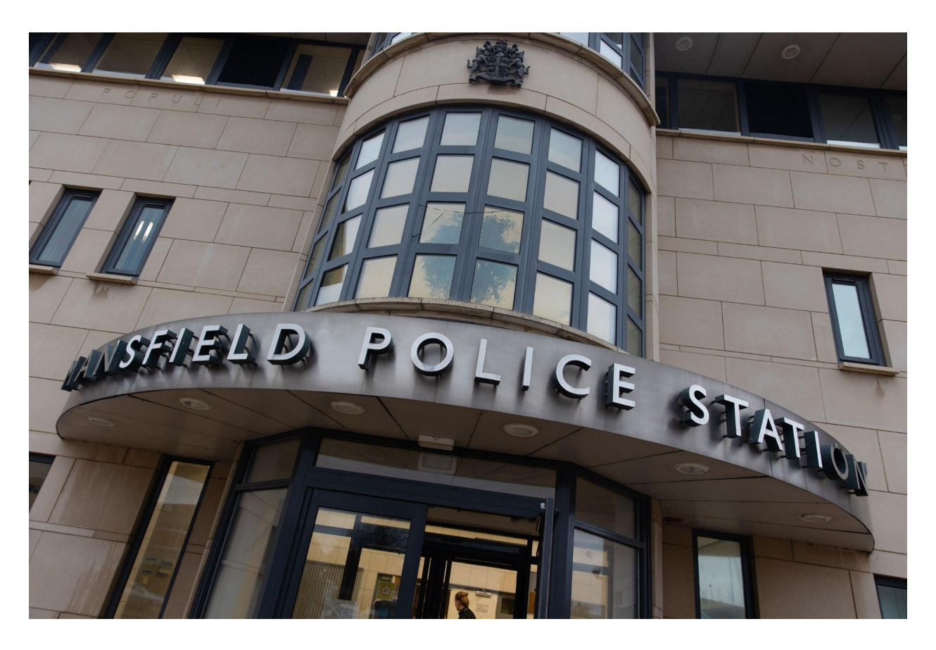
Mansfield Neighbourhood Policing Newsletter - January