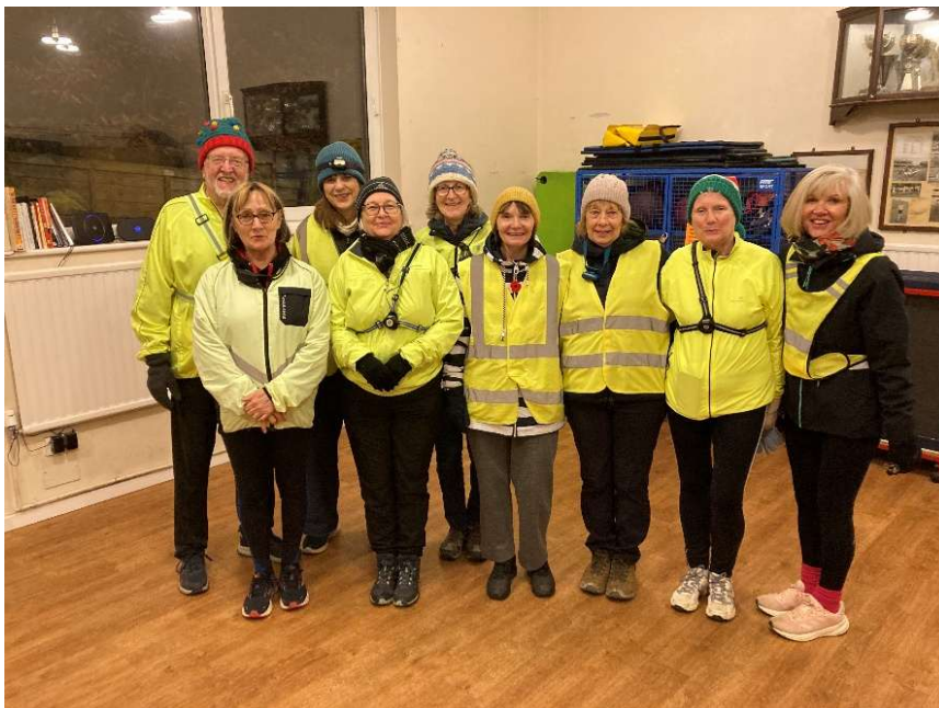
Members of The Steining Walk Fit group 😊