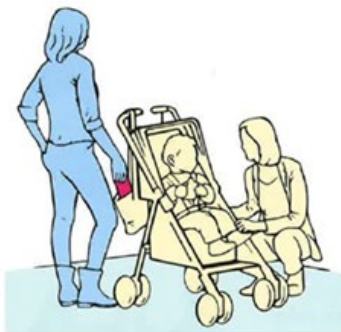
The easy dip