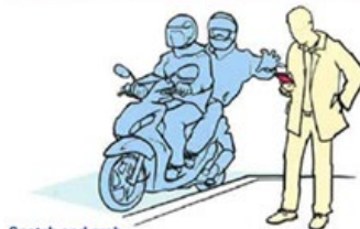
Snatch and grab

For more crime prevention advice visit www.met.police.uk/crimeprevention